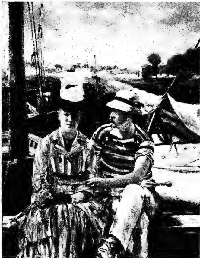
5 Argenteuil 1874 Oil on canvas 149 x 115 cm Musée des Beaux-Arts de la Ville de Tournai, Belgique