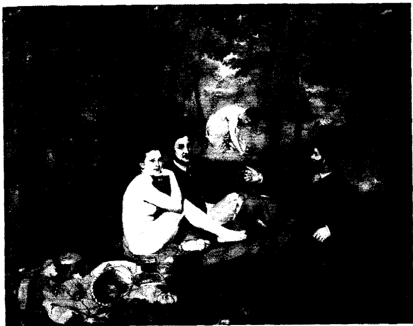
10 Luncheon on the Grass