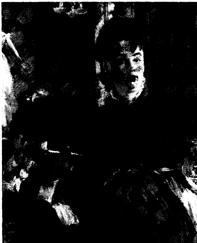
7 The Waitress 1879 Oil on canvas 77.5 x 65 cm Musée d'Orsay, Paris