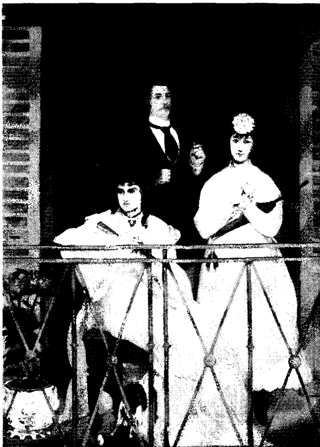
12. The Balcony 1868–9 Oil on canvas 170 x 124.5 cm Musée d'Orsay, Paris