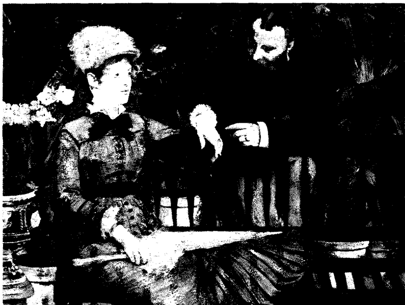
6 In the Greenhouse