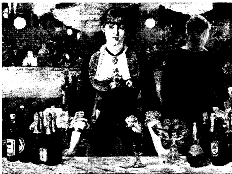
12 A Bar at the Folies-Bergères