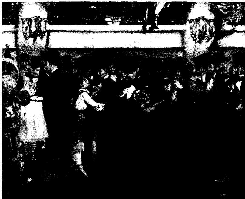
2 The Masked Ball at the Opera 1873-4 Oil on canvas 59.1 x 72.5 cm National Gallery of Art, Washington. Gift of Horace Havemeyer in memory of his mother, Louisine W. Havemeyer