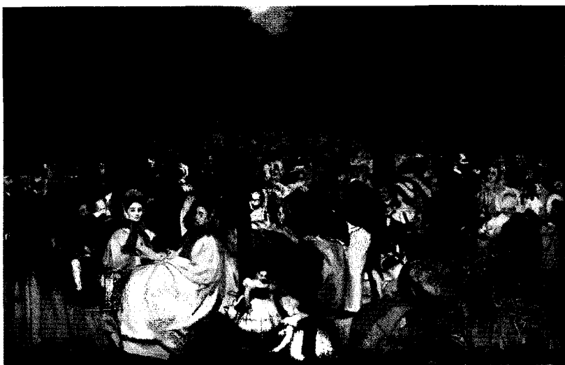
1 Muzio in the Galleries