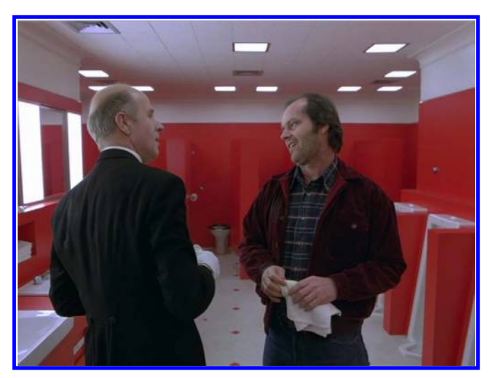
The Shining: Torrance and Grady