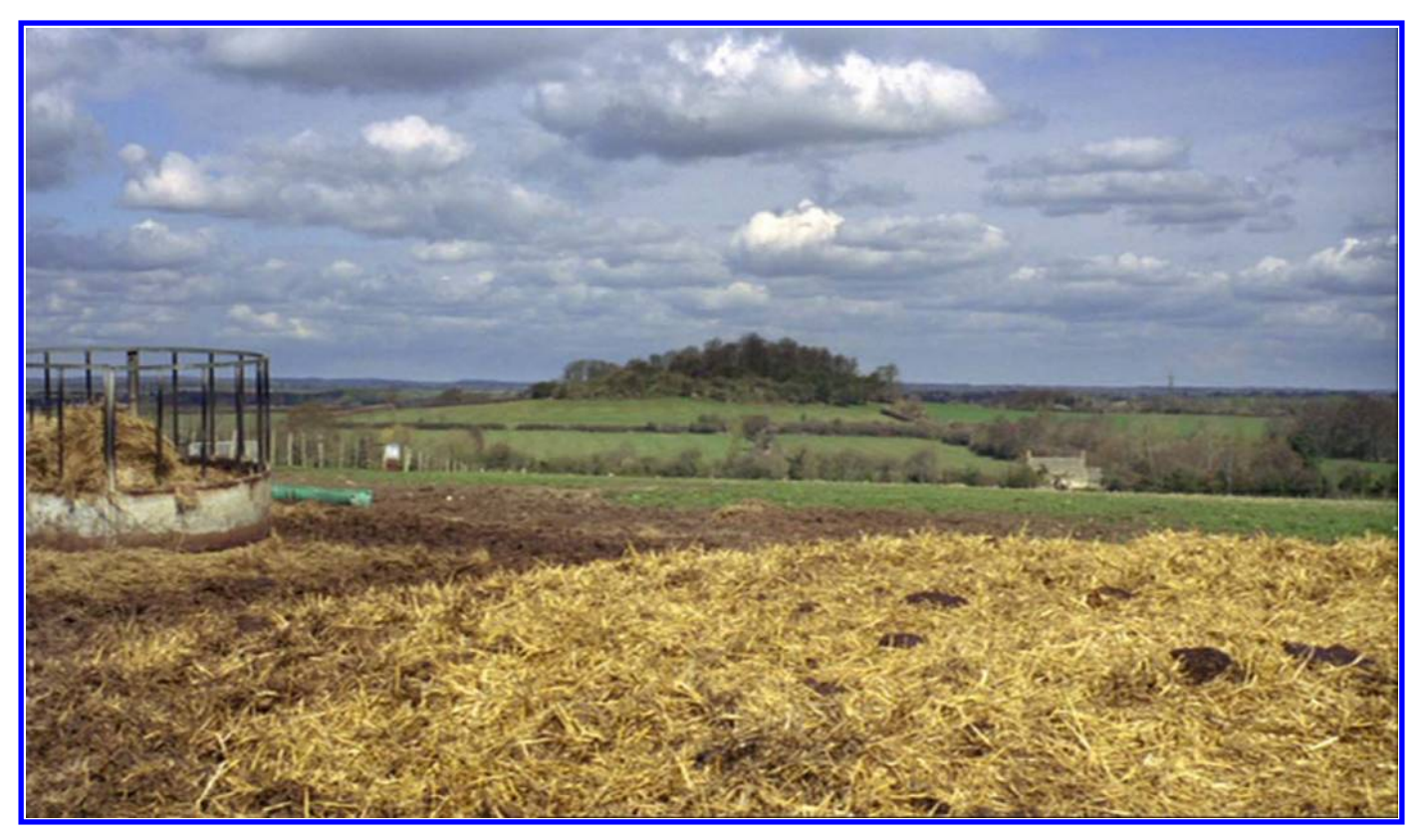
Robinson in Ruins © 2010 Patrick Keiller and the Royal College of Art. DVD: BFI Video (U.K.).