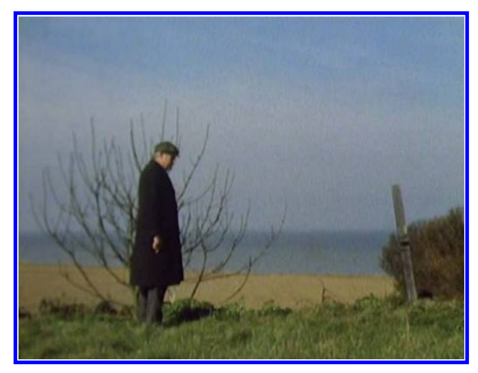
A Warning to the Curious

as it can be seen in all the revenants from earlier moments in the hotel's history that menace and seduce Jack.