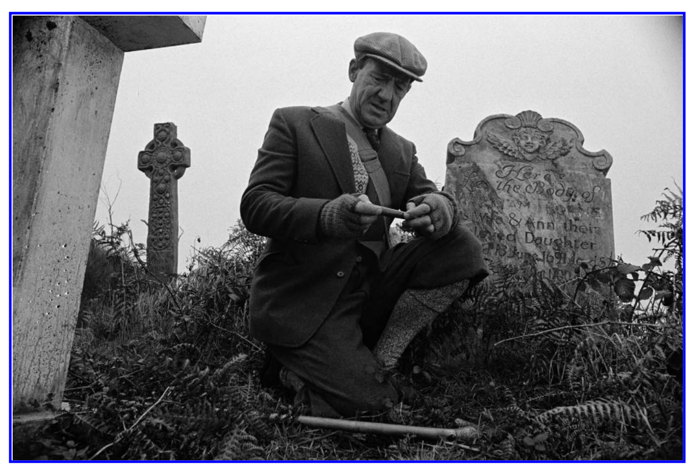
Whistle and I'll Come to You

dominated by pastiche and reiteration, hauntological music found itself at the heart of a paradox. Could the only opposition to a culture dominated by what Jameson calls the "nostalgia mode" be a kind of nostalgia for modernism?