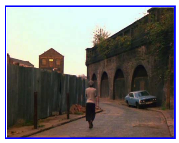
Handsworth Songs

Film Quarterly, Vol. 66, No. 1, pps 16-24, ISSN 0015-1386, electronic ISSN 1533-8630. © 2012 by the Regents of the University of California. All rights reserved. Please direct all requests for permission to photocopy or reproduce article content through the University of California Press's Rights and Permissions website, http://www.ucpressjournals.com/reprintinfo.asp. DOI: 10.1525/FQ.2012.66.1.16