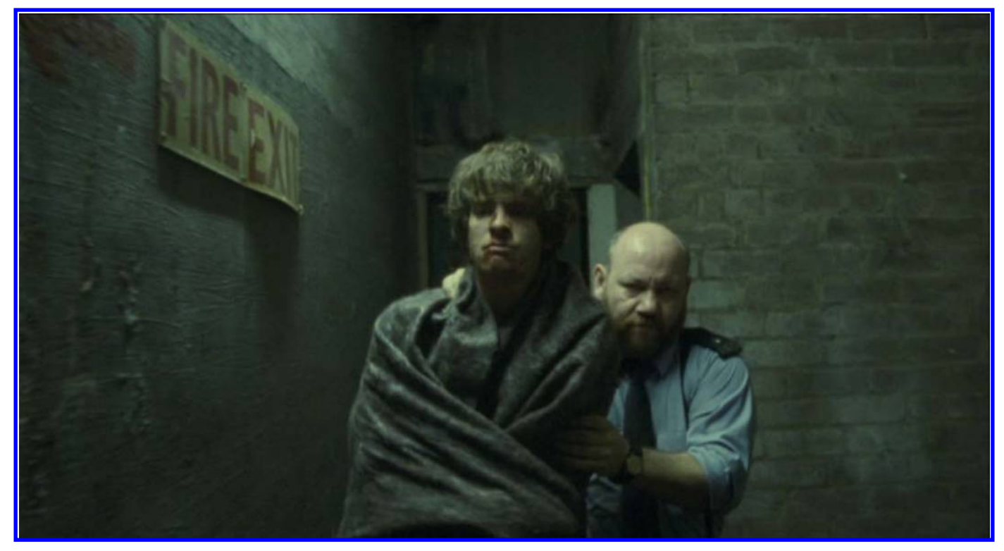
The Red Riding Trilogy: 1974 © 2009 Red Riding 1974 Limited. DVD: Optimum Home Entertainment (U.K.).

telepathically, and Quatermass and the Pit amounts to nothing less than a retelling of human history. Phenomena that seemed to be supernatural through the ages are explained as encounters with the Martian travellers who—in a twist that anticipates the recent Prometheus —interbred with apes in order to produce the human species as we now know it. The xenolithic artifact triggers a traumatic, deeply suppressed race memory of these alien origins.