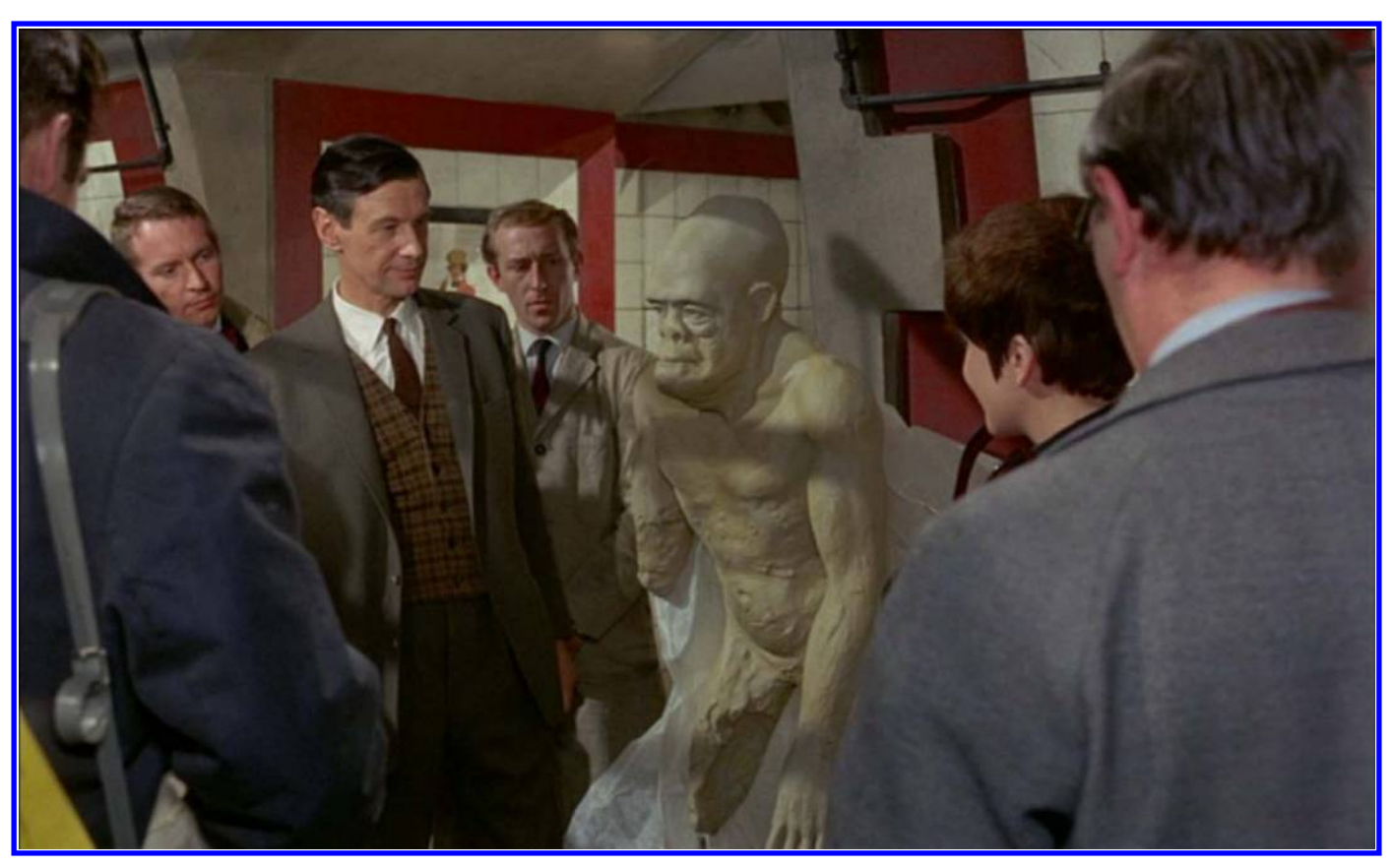
Quatermass and the Pit © 1967 Hammer Film Productions Ltd. DVD: Optimum Classics (U.K.).

and independent of human will, their existence is characterized by their forsaken status, their immemorial slumber and their provocatively exquisite forms ... Inorganic demons are parasitic by nature, they ... generate their effects out of the human host, whether as an individual, an ethnicity, a society or an entire civilization" (re.press, 2008, 223). Negarestani could also be describing here a cluster of British films and television programs made between the 1950s and the 70s. The fiction of M. R. James, Kneale, and Alan Garner is fixated on the encounter with such "inorganic demons" in specific (hauntological) landscapes—landscapes stained by time, where time can only be experienced as broken, as a fatal repetition. To consider the films and television programs based on these writers' work now is to be caught up in a hauntology that is (at least) double. For these works were hauntological in the sense that, like The Shining, they were about the virtual agency of the no longer. In this, they constitute a kind of "pulp modernist" answer to Freud's psychoanalysis and to the attempt to recover lost time in the literary experimentations of Proust and Joyce. Yet this kind of public service broadcasting, and the broader popular modernist culture of which it was a part, itself now belongs to the no longer. There is a special charge to be had from disinterring these