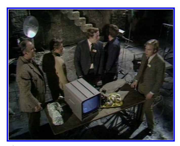
The Stone Tape © 1972 BBC. DVD: BFI Video (U.K.).

the consumer present, together with a conspicuous use of digitally enabled technologies such as CGI. Yet this anxious insistence on the paraphernalia of the contemporary obfuscates the fact that the formal features of what we are seeing and hearing are familiar to the point of being exhausted. Relentless technological upgrades—the same thing, seen and/or heard on a new platform—disguise the disappearance of formal innovation and new kind of sensory experience.