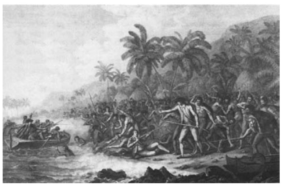
The Death of Cook (John Webber), 14 February 1779, at Ka'awaloa, Kealakekua, Hawaii.