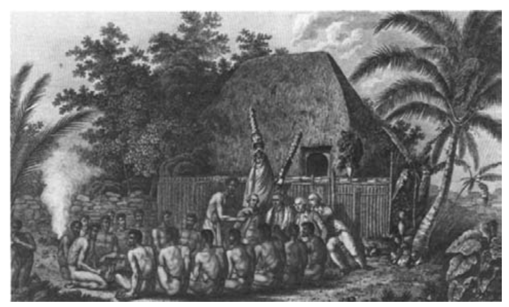
Hānaipū Ceremony at the "House of Lono," Kealakekua, Hawaii, 19 January 1779, (John Webber).